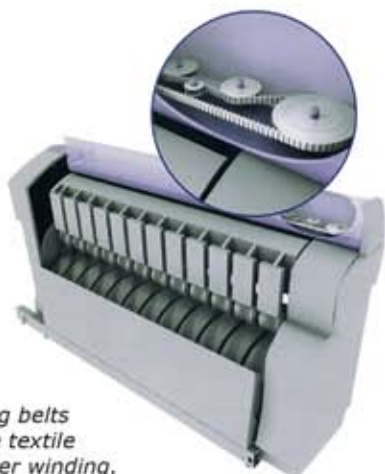
Double sided, truly endless, urethane timing belts are used in the textile industry for fiber winding.